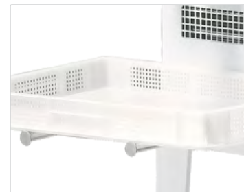
PASTA COLLECTING (OPTIONAL)